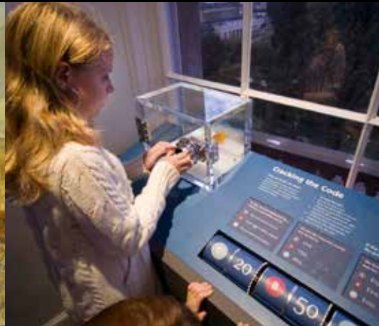
△ Cracking the safe