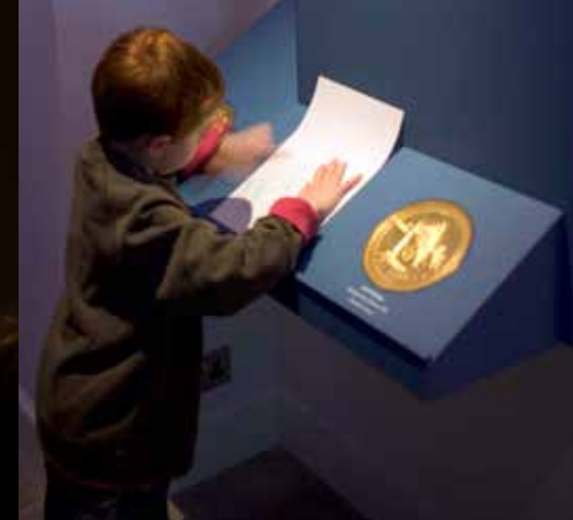
▷ Applying for life assurance - 1820s style