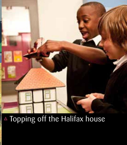
▷ Topping off the Halifax house