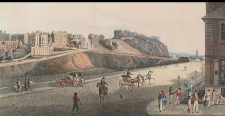
△ View of the Old Town of Edinburgh by J. Clark, 1812