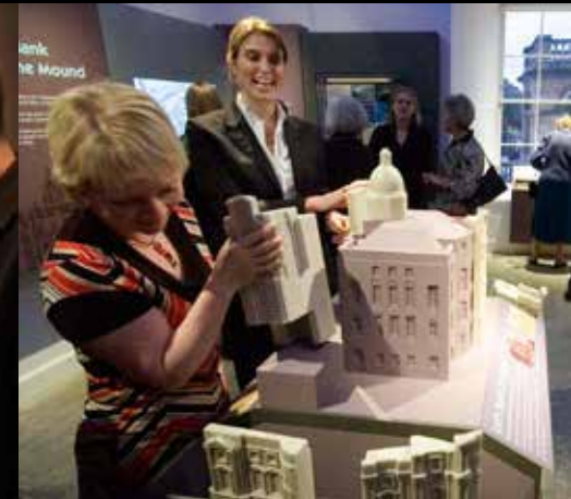
▷ Building the Bank - the easy way!