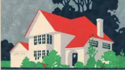
△ Halifax mortgage advert, 1930