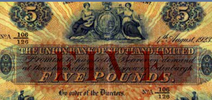
△ Union Bank of Scotland 'sunburst' £5, 1923