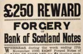
△ Police notice, 1888