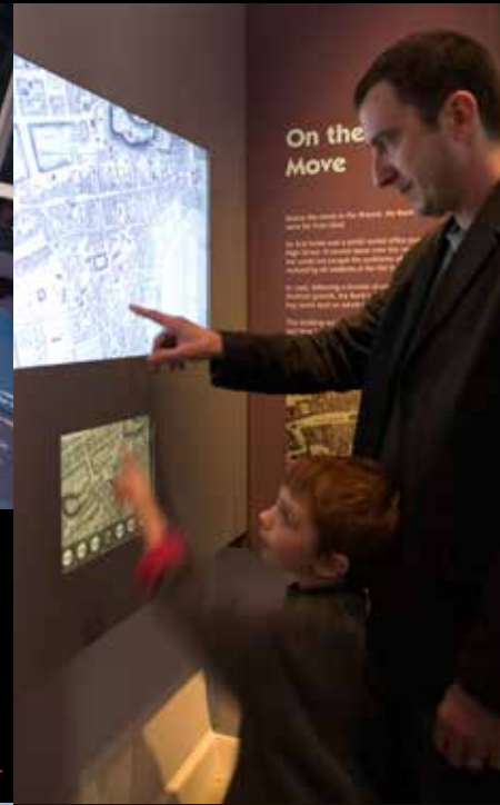
Exploring historic Edinburgh ▷