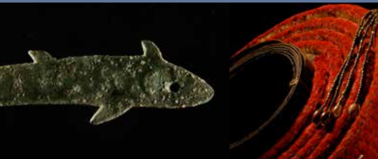
△ Money from Ancient China and Solomon Islands