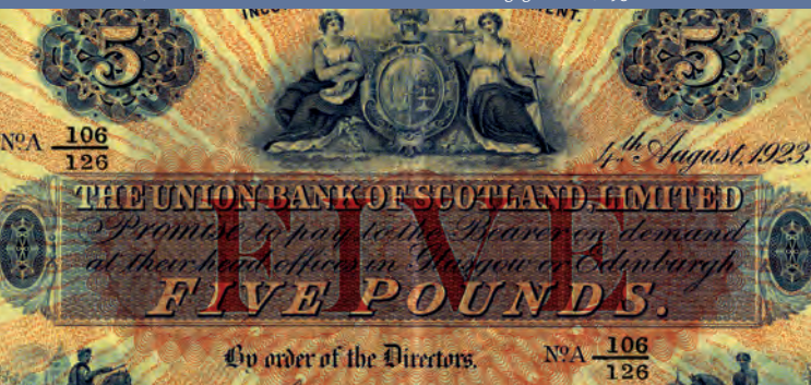
△ Union Bank of Scotland 'sunburst' £5, 1923