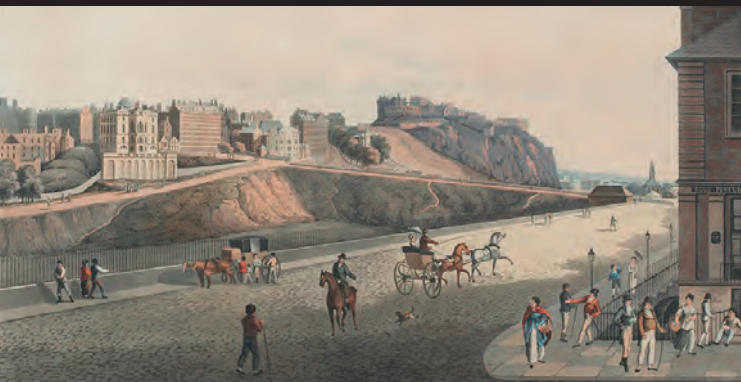
△ View of the Old Town of Edinburgh by J. Clark, 1812