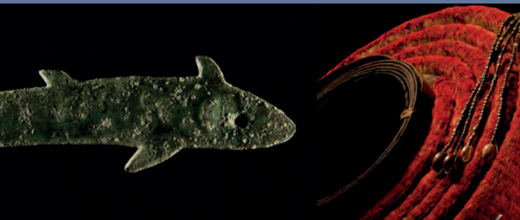
△ Money from Ancient China and Solomon Islands